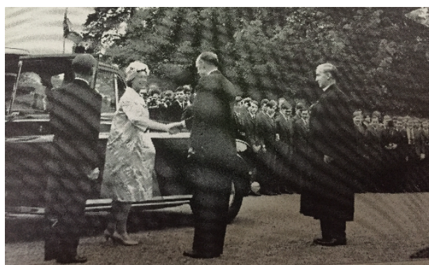
The Queen arriving at Beaumont – 15 th May 1961