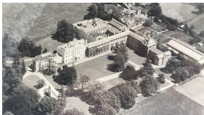
Beaumont College 1961 - Centenary Year