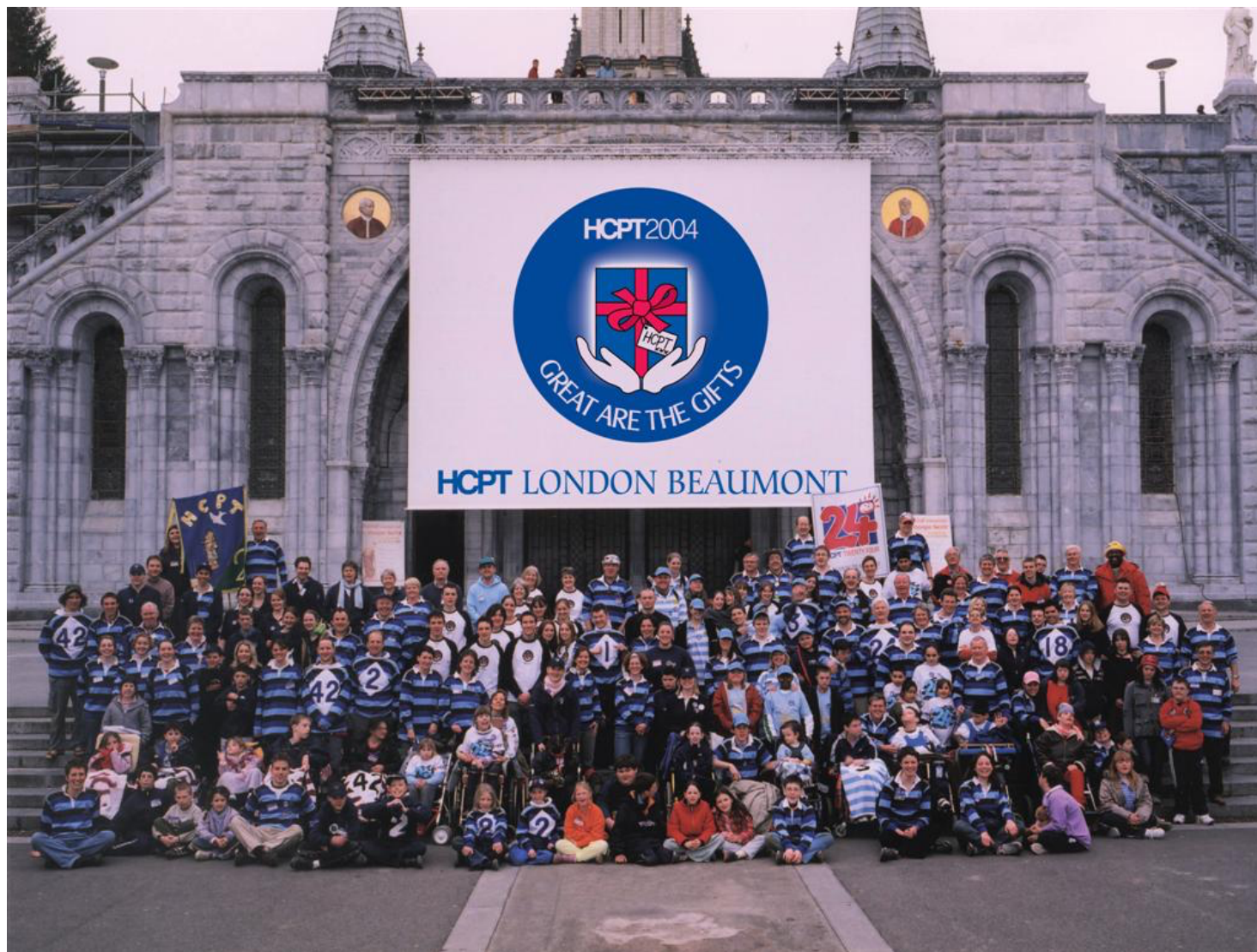
The London Beaumont Region in April 2004 comprising Groups 1, 2, 3, 18, 24, 35 & 42 on the occasion that the Region led the Liturgy and the Regional Beaumont Rugby shirts were inaugurated

and from a different and current millennium